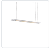
LP20448-BN Brushed Nickel